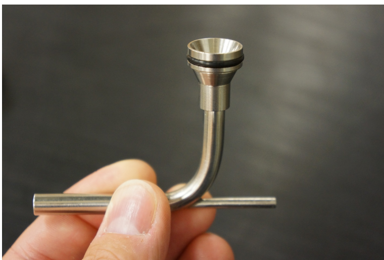
The dispersion nozzle from the NIOSH Venturi dustiness testing device. The nozzle is loaded with milligram quantities of fine and nanoscale powdered materials and subsequently dispersed within the Venturi device. Materials may be compared by their dispersion potential (dustiness).