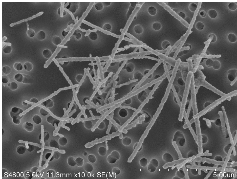
TiO 2 nanowires on a track-etched polycarbonate filter.